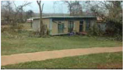
<- Galiwin'ku Bible Translation Centre

GOD's protection is amazing!!! There were no deaths or injuries! June Blacket was praying for a 'bubble of protection' as the cyclone approached. Afterwards, Yolŋu walked around looking at the buildings which were undamaged, and commenting on who lived there.